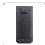
Li-polymer Battery 4000mAh