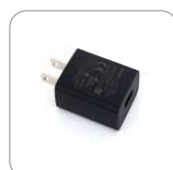
Power Adapter (USB)