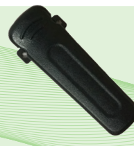
SDP700 Series belt clip 7A0BB000Z00