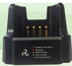
SDP700 Series single way charger including power lead 7A0BC00SZC1-B1