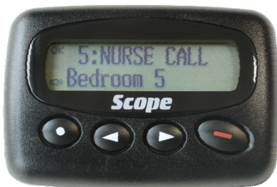
Two-line zoom mode gives clear bold text for quick, easy reading

Four button operation with icon driven menu options make the GEO 28RC pager quick and easy to use. The four line dot matrix screen displays your text in a clear easy to read format. Add to this a compact ergonomic case design and USB charging and you have a classic pager suitable for most paging applications