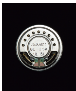
Icom custom high power handling capacity speaker