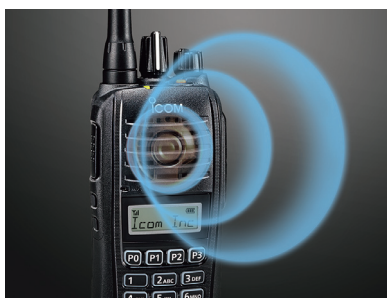
1500 mW powerful audio