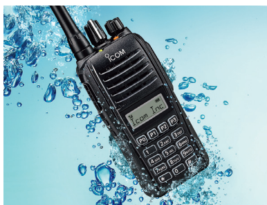
Waterproof for 30 minutes in one meter depth of water