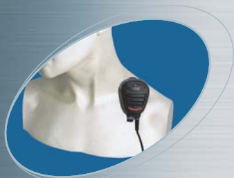
■ CMP750 ● CMP850 ▲ CMP950