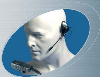
■ EA19/750 ● EA19/850 ▲ EA19/950