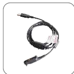
Programming cable PC155