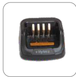
MUC Rapid-rate Charger