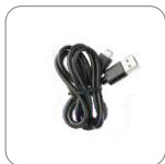
Data cable PC143