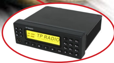
BE905 mounted directly on the TP6000i