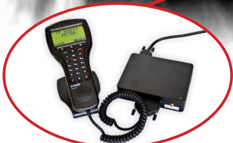
BE901 Mjölner mounted on the TP6000i via RS232