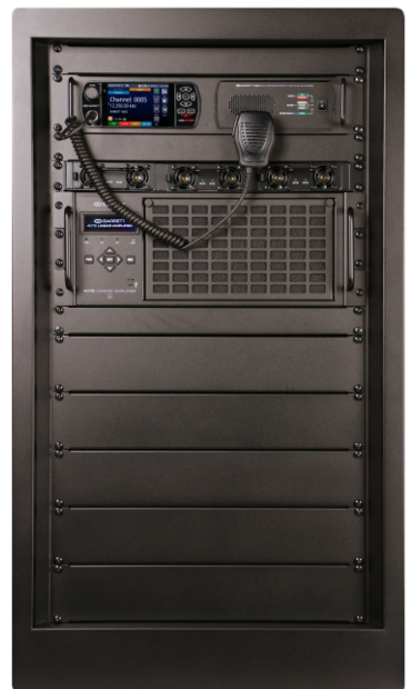
500W 4075 Transportable transmitter in 9RU 19" rack mount case