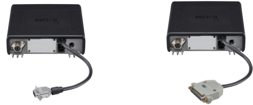
Optional OPC-1939 installation image Optional OPC-2078 installation image