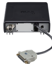
Optional OPC-2078 installation image