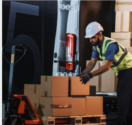
Increase efficiency and responsiveness when working to tight schedules.