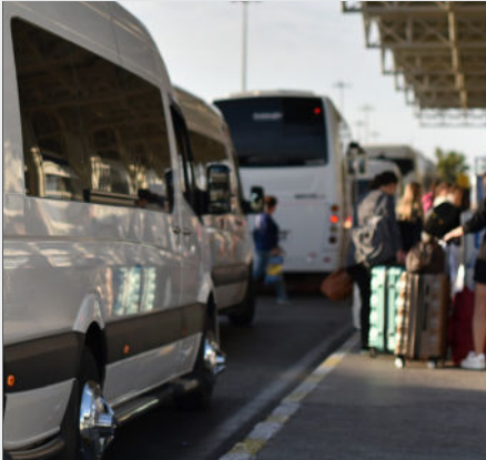
Ideal for small fleets to coordinate mobile operations.