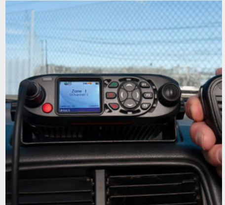
Trigger emergency calls via the dedicated orange button or loneworker feature.